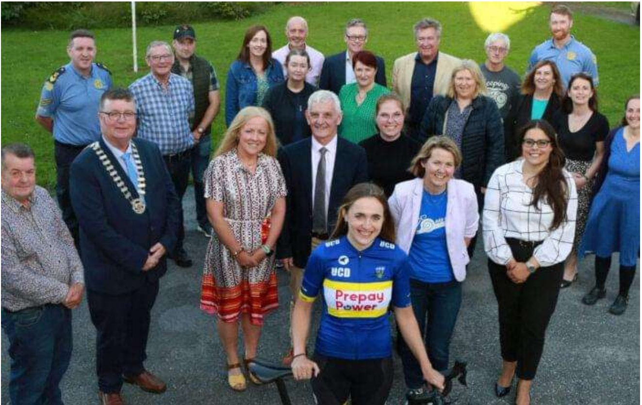
Snap taken at Launch (of Stage 3) in Mountrath (Bloom HQ) on 23 rd July